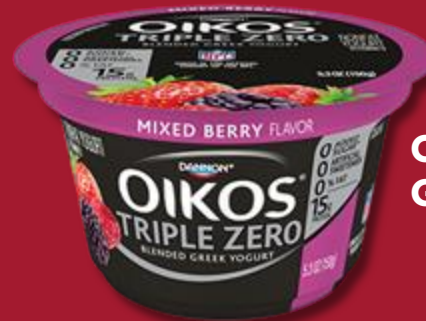
Oikos Greek Yogurt