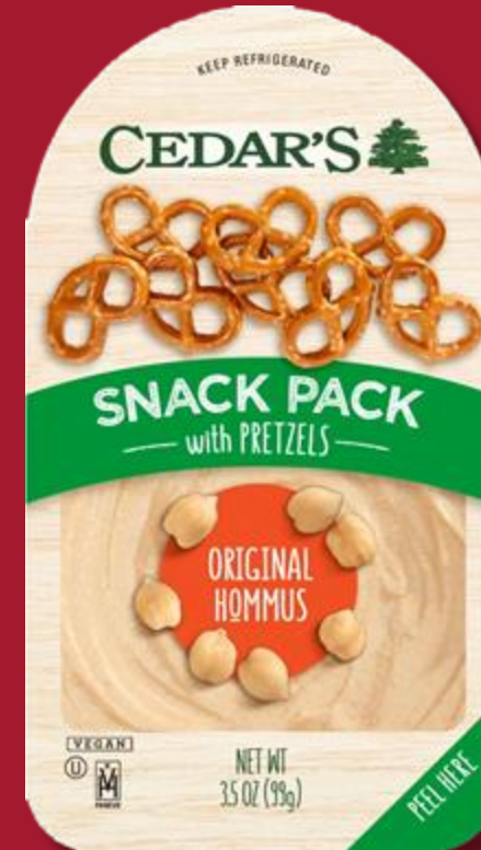
Hummus Snack Pack