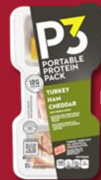
P3 Protein Pack