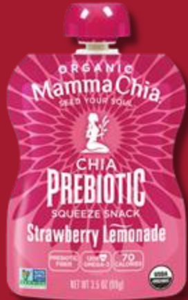
Chia Seed Pouches