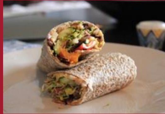
Grilled Vegetable & Hummus Wrap