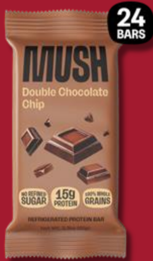
Mush Protein Bar