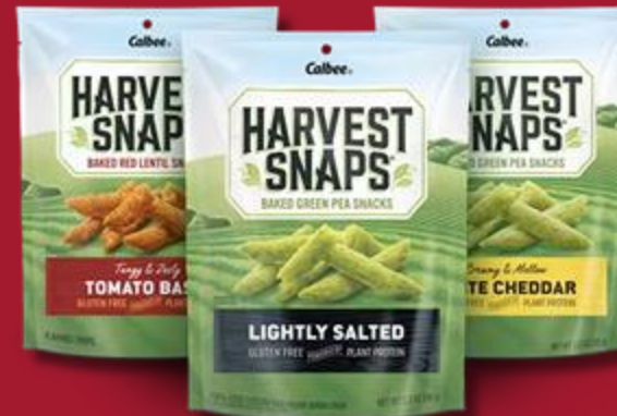
Harvest Snaps Baked Peas