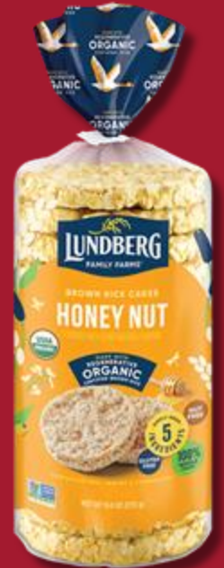
Honey Nut Rice Cakes