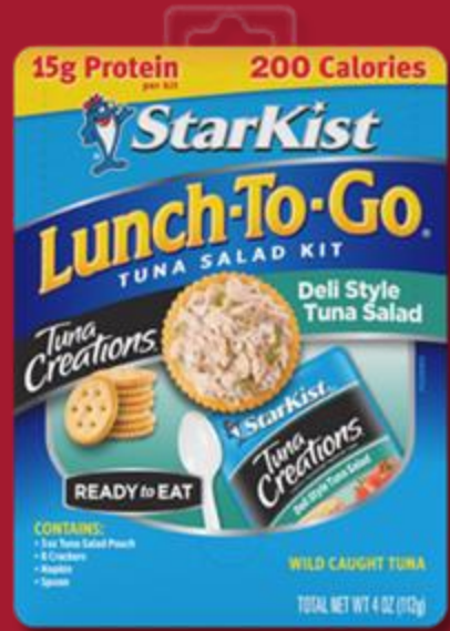
Tuna & Crackers Kit