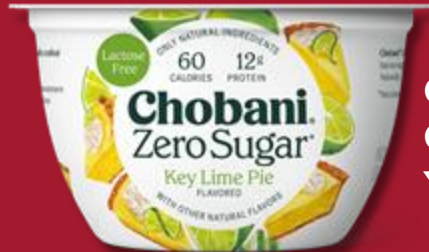
Chobani Greek Yogurt