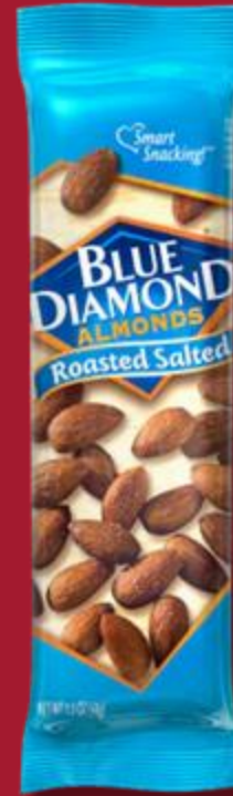
Blue Diamond Almonds