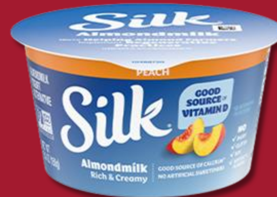
Silk Dairy-Free Yogurt