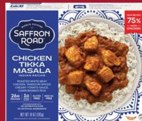
Saffron Road Chicken Tikka Masala