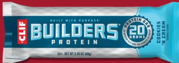
Clif Builder Protein Bar