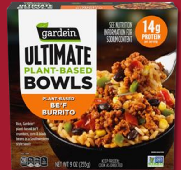
Gardein Be'f Bowl