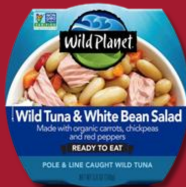
Wild Planet Tuna Salads