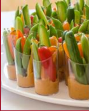
Hummus with Veggies