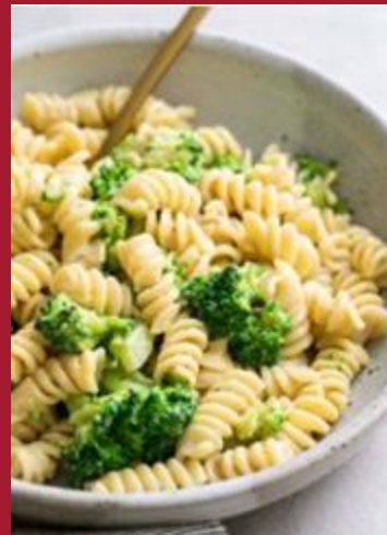
Lemon Broccoli Chicken Bowl