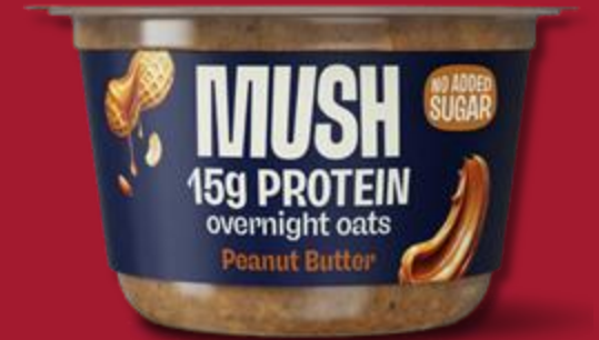
Mush Overnight Oats