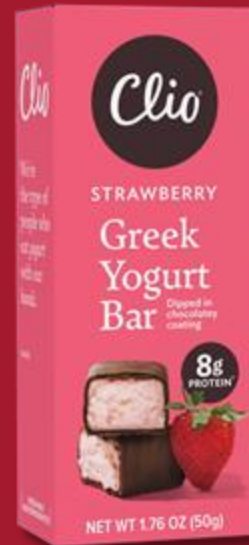
Clio Greek Yogurt Bar