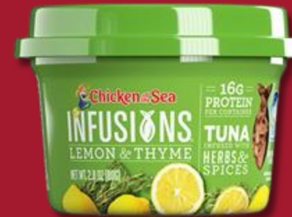
Lemon & Thyme Tuna