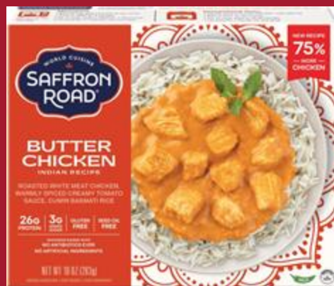
Saffron Road Butter Chicken