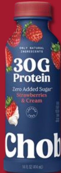
Chobani Protein Shake