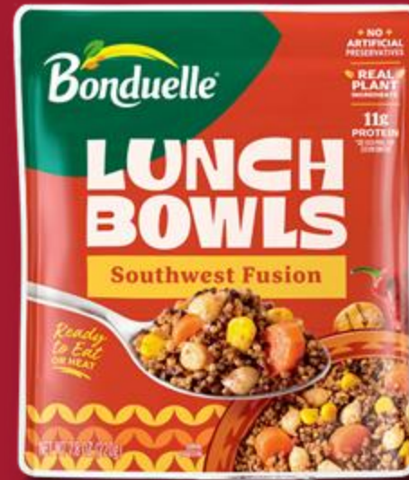
Southwest Fusion Lunch Bowl