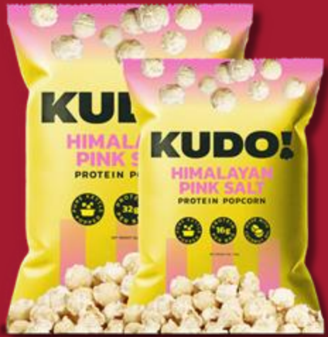
Kudo Protein Popcorn