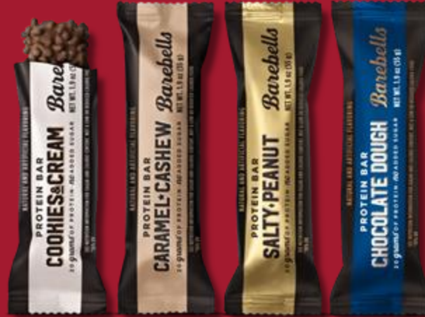
Barbell Protein Bar