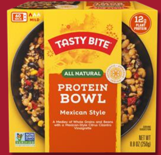
Tasty Bite Protein Bowl