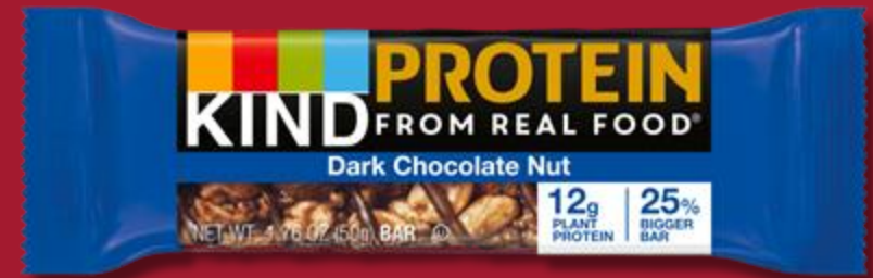
Kind Protein Bar