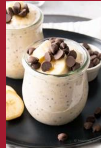
Chocolate & Banana Overnight Oats