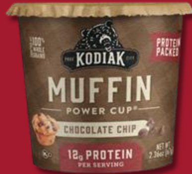
Kodiak Protein Muffin