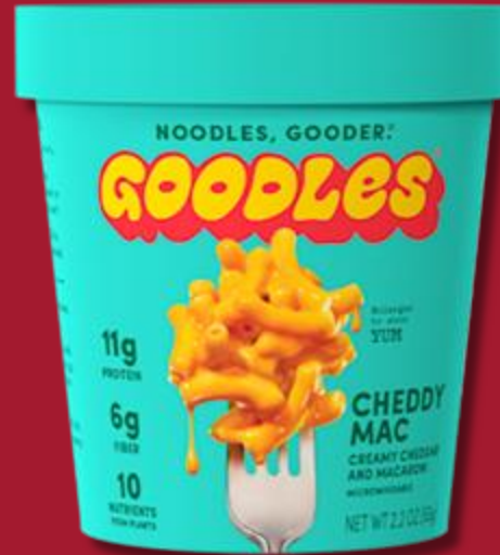
Goodles Mac N Cheese