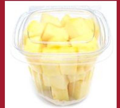
Pre-Cut Fruit Cups