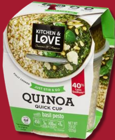
Quinoa & Pesto Cups