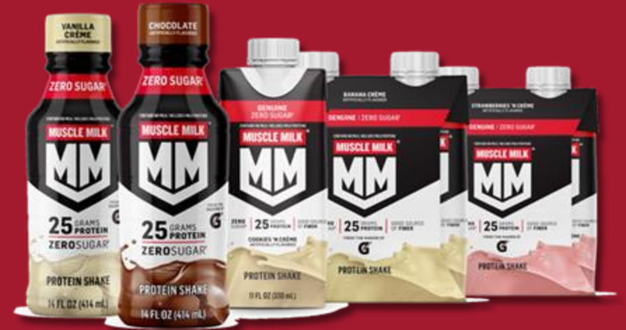
Muscle Milk Protein Shake