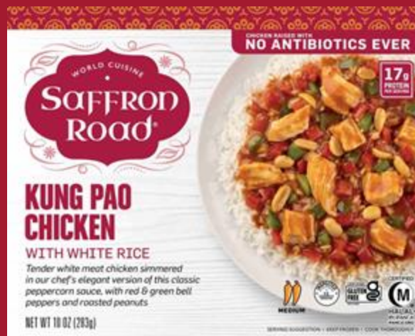
Saffron Road Kung Pao Chicken