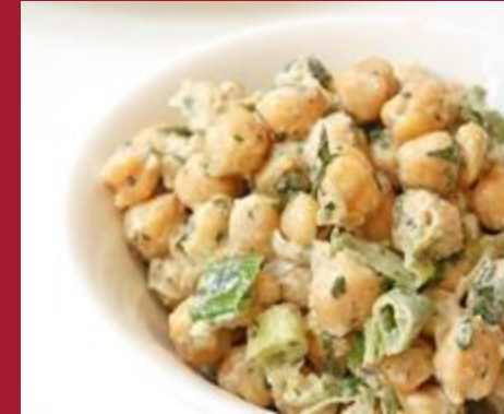
White Bean & Kale Salad