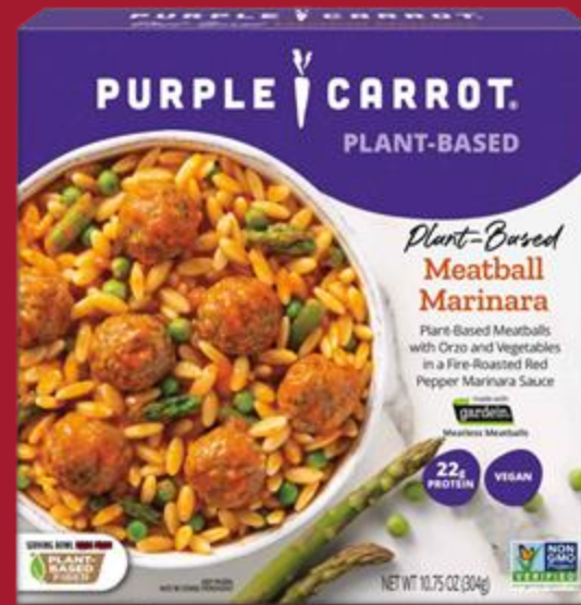
Purple Carrot Meatball Marinara