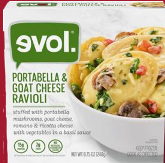
EVOL Mushroom & Cheese Ravioli