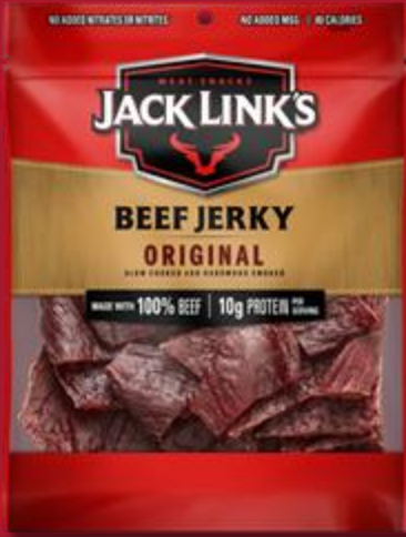
Jack Link's Beef Jerky