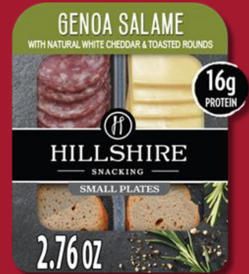
Hillshire Charcuterie Pack