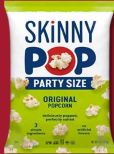
Skinny Pop Popcorn