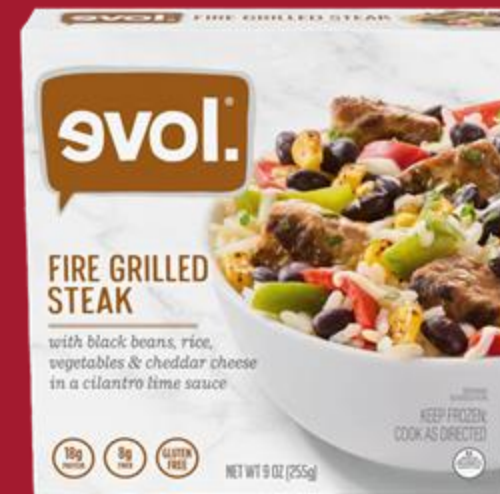
EVOL Fire Grilled Steak Bowl