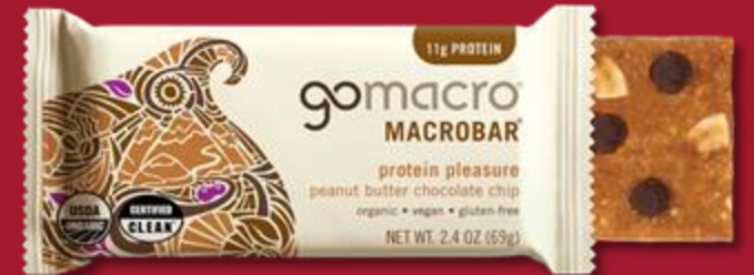
GoMacro Protein Bar